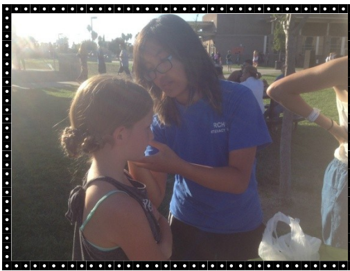
Interact does face painting at the Farmer's Market.

Más Fun, Más Adventure! Live Más with Rotary!