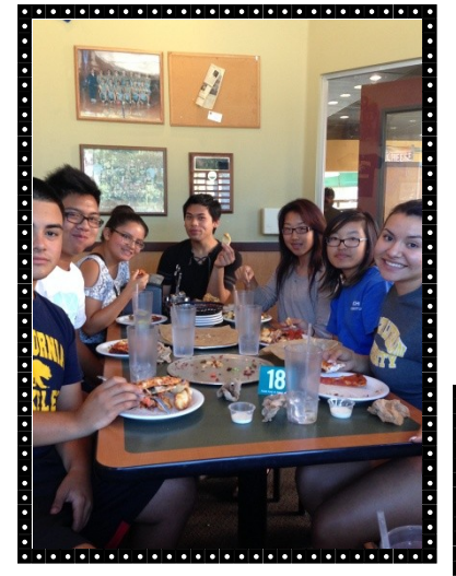
Interact Board of Directors meet to plan out the school year.

Our President enjoys some pizza with Interact.